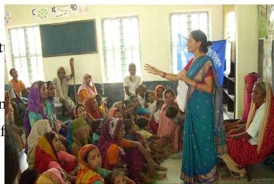
Participants in Civic Education on Constitution and CA